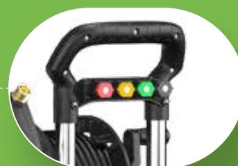
BUILT-IN HOLDERS for nozzles and accessories