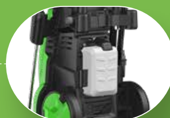
BUILT-IN 1,2 LITER CHEMICAL TANK AND HIGH-PRESSURE FOAMER