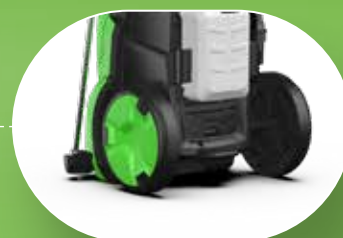
TWO LARGE WHEELS