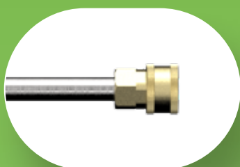
QUICK-CONNECT FITTINGS for fast attachment