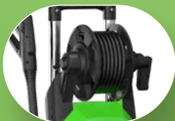
HOSE REEL with foldable handle