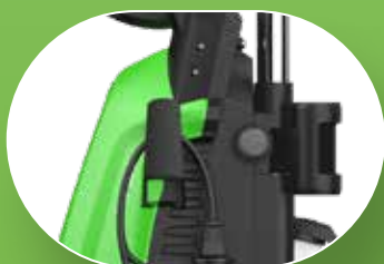
INTEGRATED CABLE HOLDER