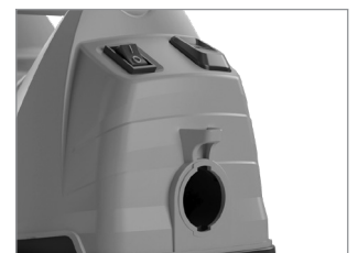
BLOWING FUNCTION (ONLY FOR ISY)