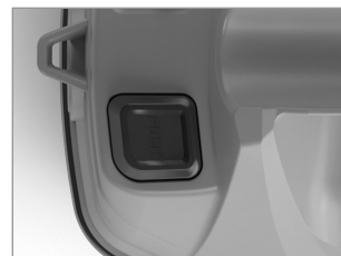
PUSH THE BUTTON TO CLEAN THE FILTER