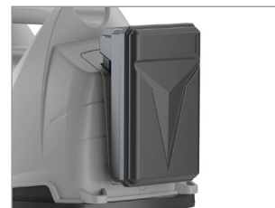
LI-ION BATTERY 30 MIN USE (ONLY FOR ISY LI-ION)