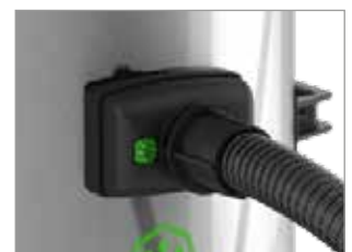
FLEXIBLE HOSE IS LOCKED SECURELY AND RELIABLY