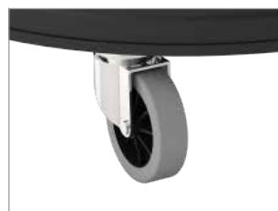
TROLLEY WITH SWIVELLING WHEELS