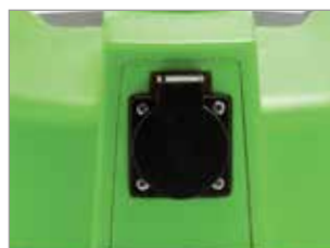
SOCKET FOR POWER TOOL WITH AUTOMATIC START/STOP (TC)