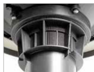
INTEGRATED ANTI-FOAM SYSTEM