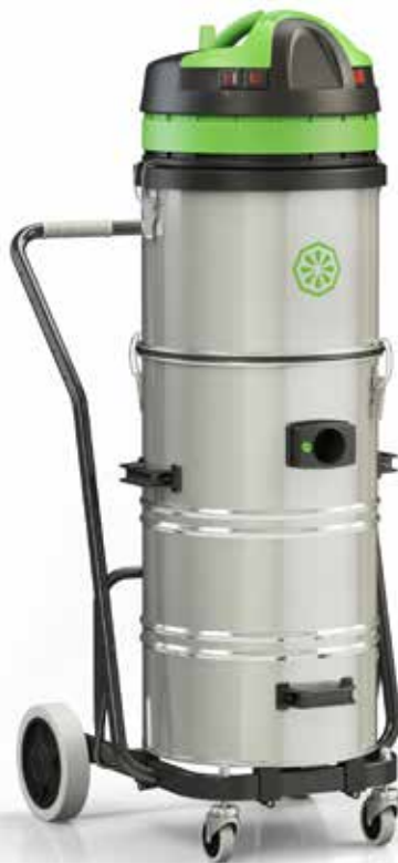
GS 3/78 CYC