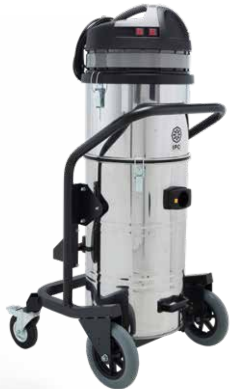
GS 3/78 OPT CYC