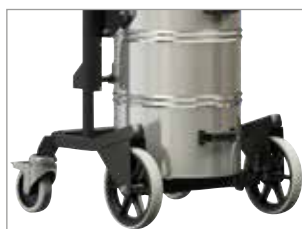
OPTIM TROLLEY IS EXTREMELY DURABLE AND MANEUVERABLE