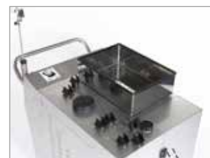
STAINLESS STEEL - STORAGE COMPARTMENT