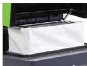
FILTER REPLACEMENT WITHOUT TOOLS