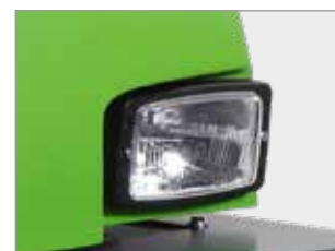
LIGHT SYSTEM AS STANDARD EQUIPMENT