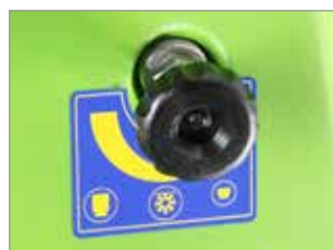
AUTOMATIC BRUSH PRESSION