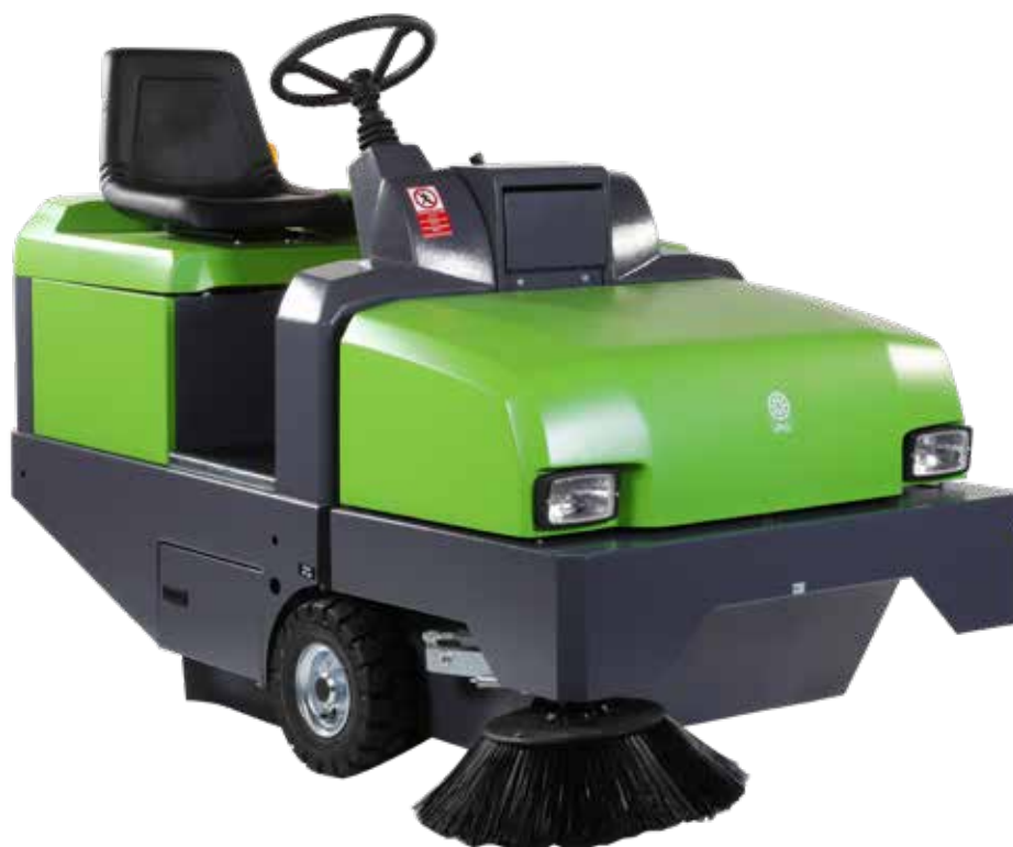
BATTERY VERSION WITH BATTERY AND CHARGER NOT INCLUDED