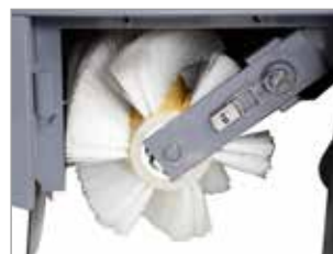
NO TOOLS REQUIRED TO REPLACE THE CENTRAL BRUSH