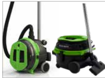
DOUBLE PARKING POSITION