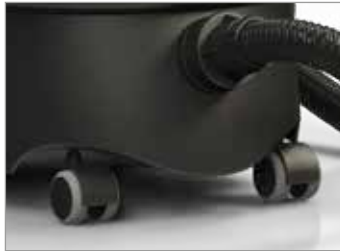
NON-MARKING RUBBER WHEELS: the rubber cover avoids any noise effects on tilted floors and unlevelled surfaces