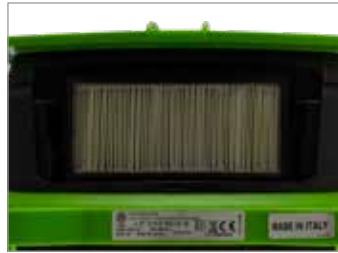
HEPA / POLY CARTRIDGE DOWNSTREAM