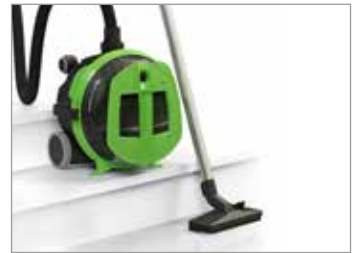
STEP POSITION: simple to use even in very small spaces and on stairs