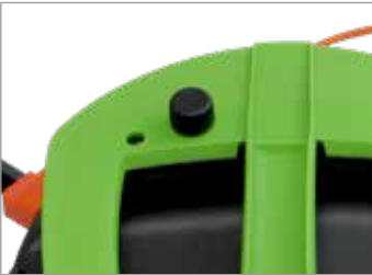
SPEED REGULATOR ALLOWS NOISE ADJUSTMENT WHEN REQUIRED