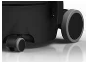
NON-MARKING RUBBER WHEELS: the rubber cover avoids any noise effects on tilted floors and unlevelled surfaces