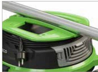
TUBE CAN BE ALSO GRABBED WITH HANDLE