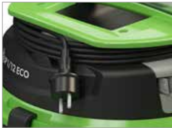
CONVENIENT HANDLE WITH INTEGRATED CABLE WRAP