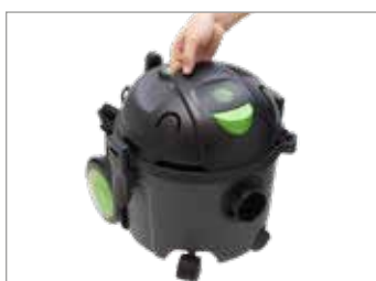
LIGHTWEIGHT DESIGN (ONLY 3,7 KG)