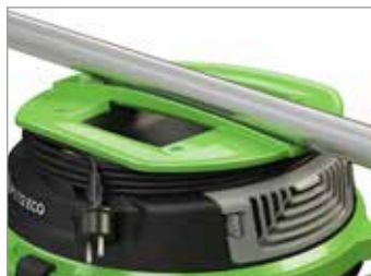
HANDLE WITH INTEGRATED CABLE WRAP. TUBE CAN BE ALSO GRABBED WITH HANDLE