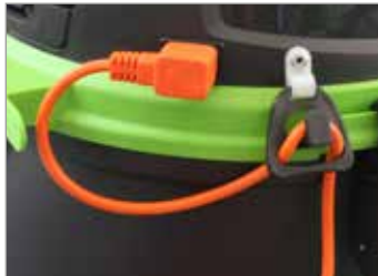
DETACHABLE CABLE AVOIDS DISASSEMBLY OF THE MACHINE IN CASE OF FAULTY