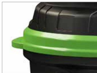
SIDE PROTECTIONS AGAINST DOORS AND WALLS: bumpers protect the machine from damages and surrounding obstacles