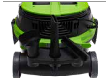
TOOLS HOLDER OPTIONAL KIT