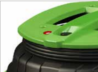
FULL BAG INDICATOR: warning light "on" when bag is full