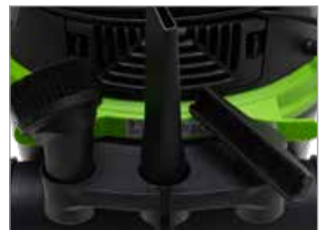
TOOLS HOLDER OPTIONAL KIT