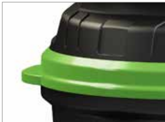
SIDE PROTECTIONS AGAINST DOORS AND WALLS: bumpers protect the machine from damages and surrounding obstacles