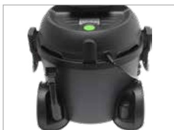
FOOT-ACTIVATED ON/OFF SWITCH ON-BOARD TOOLS STORAGE