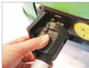
STEAM HOSE HOOK EQUIPPED WITH SAFETY PANEL