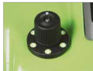
ROTARY KNOB FOR STEAM FLOW RATE CONTROLLER