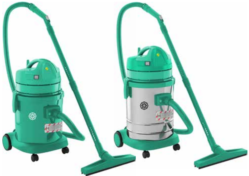
GP 1/27 HEPA ISO5