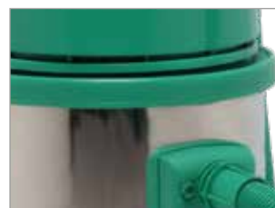
ANTIBACTERIAL PLASTIC AND STAINLESS STEEL AISI 304