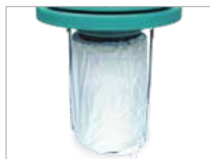
HEPA H14 CARTRIDGE WITH POLYCARBON PREFILTER