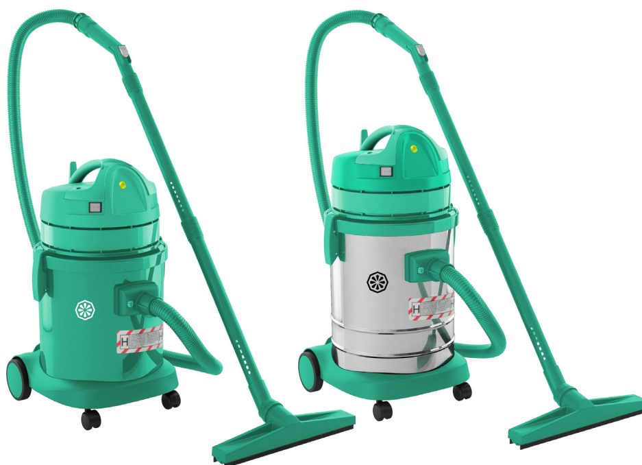
GP 1/27 HEPA ISO5