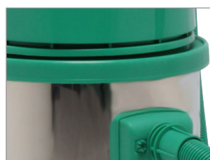
ANTIBACTERIAL PLASTIC AND STAINLESS STEEL AISI 304