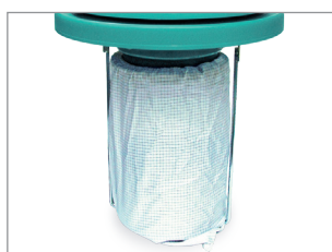
HEPA H14 CARTRIDGE WITH POLYCARBON PREFILTER