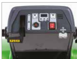
INTUITIVE CONTROL PANEL