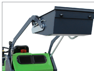
HOPPER HYDRAULIC DISCHARGE SYSTEM