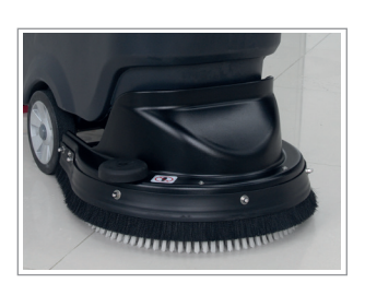
QUICK CONNECT BRUSH HEAD