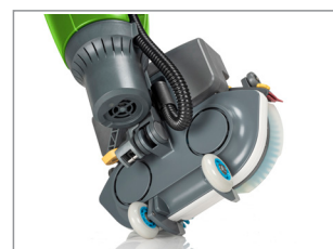
EASY STORAGE AND TRANSPORTATION