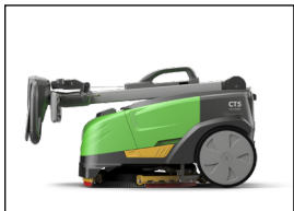
FOLDABLE HANDLE FOR STORAGE AND TRANSPORTING