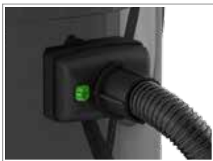
FLEXIBLE HOSE LOCKED SECURELY