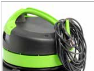
INTEGRATED CORD WRAP