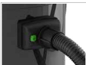
FLEXIBLE HOSE LOCKED SECURELY