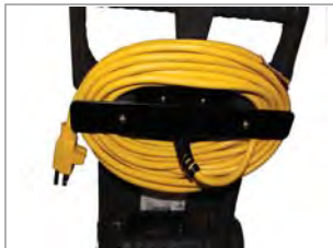
BUILT IN CORD STORAGE