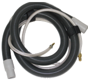
TOOL & HOSE ACCESSORY BAG (SC7 & SC12) FX1049AC