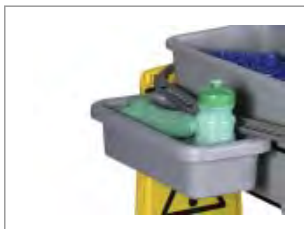
PLENTY OF STORAGE