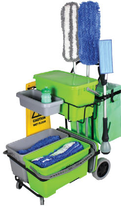
One Cart 300