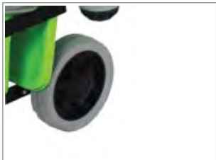
EASILY TRANSPORTABLE WHEELS