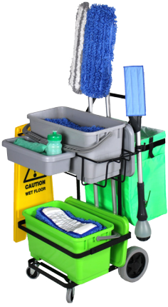
One Cart 200