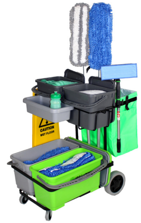
One Cart 410