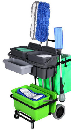
One Cart 310