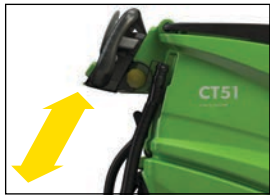
ADJUSTABLE HANDLE FOR COMFORTABLE AND EASY USE