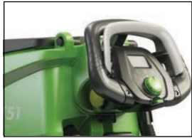
FULL MACHINE CONTROL DUE TO INTUITIVE CENTRAL DIAL