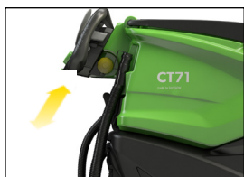
PRESET WORKING PROGRAMS