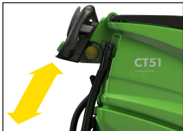
ADJUSTABLE HANDLE FOR COMFORTABLE AND EASY USE