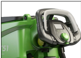
FULL MACHINE CONTROL WITH INTUITIVE CONTROL DIAL