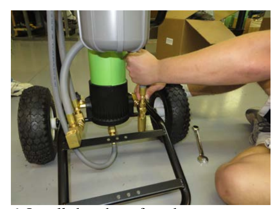
6. Install short hose from brass connectors into bypass valve. (Where black plastic elbow was removed from step 4) Use Teflon tape on threads. Wrench 11/16"