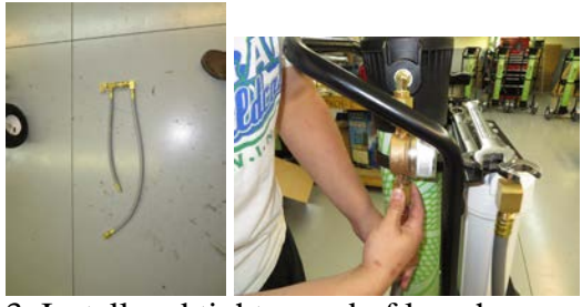
3. Install and tighten end of long hose from Brass quick disconnect kit that is provided to the water meter. Use Teflon tape on threads. Wrench 1 1/8"