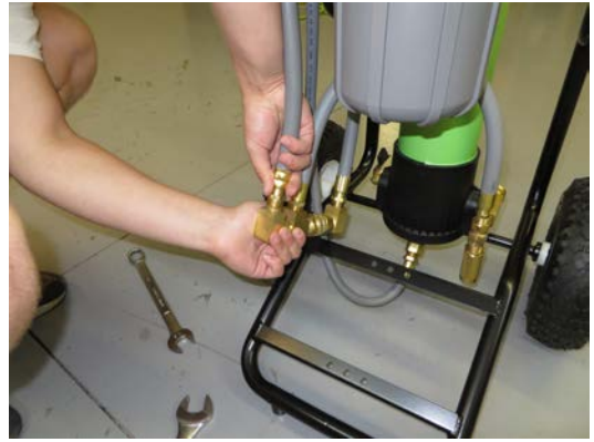
7. Connect hose from carbon block filter housing to brass connector block. Use Teflon tape. Wrench 7/8"