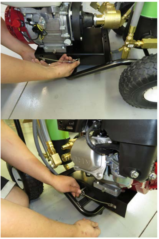
10. Attach motor to cart by inserting pins into the mounting bracket.