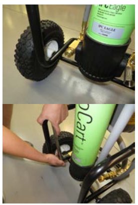
8. Remove flow restrictor. Replace with provided new one. Use Teflon tape. Wrench 1 1/16"