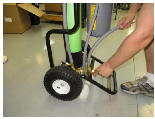
5. Position brass connectors into place as shown.