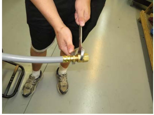
2. Remove fitting from end of hose. The fitting can be thrown away. Wrenches 1" and 7/8