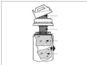
4 STAGE FILTERS