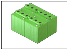
2-4 BATTERIES FOR LONG RUN-TIME