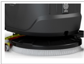
SPIN-ON, SPIN-OFF BRUSH