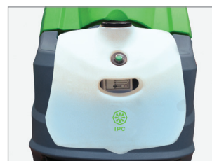
SEPARATE DETERGENT DOSING SYSTEM. (OPTIONAL)