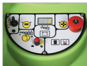
INTUITIVE CONTROL PANEL