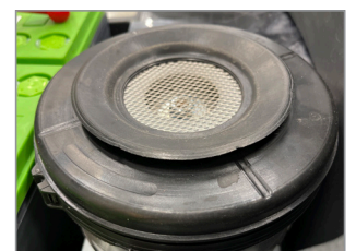
THREE STAGE VACUUM MOTOR