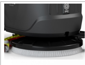
SPIN-ON, SPIN-OFF BRUSH