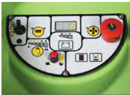
INTUITIVE CONTROL PANEL