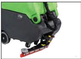
"V" SHAPED SQUEEGEE