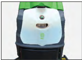
SEPARATE DETERGENT DOSING SYSTEM (OPTIONAL)