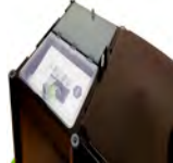
COUNTER TOP HINGED CLEAR KTRI02355