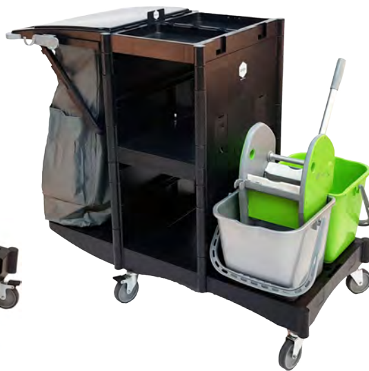
BRIX CART WITH TWO BUCKET MOP SYSTEM