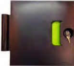
DOOR METAL LOCKS MPVR04779