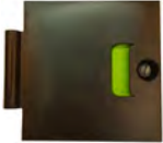
DOOR PLASTIC LOCKS MPVR494847