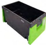
DRAWER KTRI02354- SINGLE