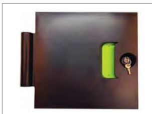
OPTIONAL DOORS WITH LOCKS