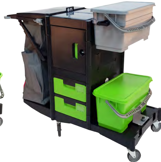
BRIX CART WITH TWO BUCKET PRE-TREAT SYSTEM