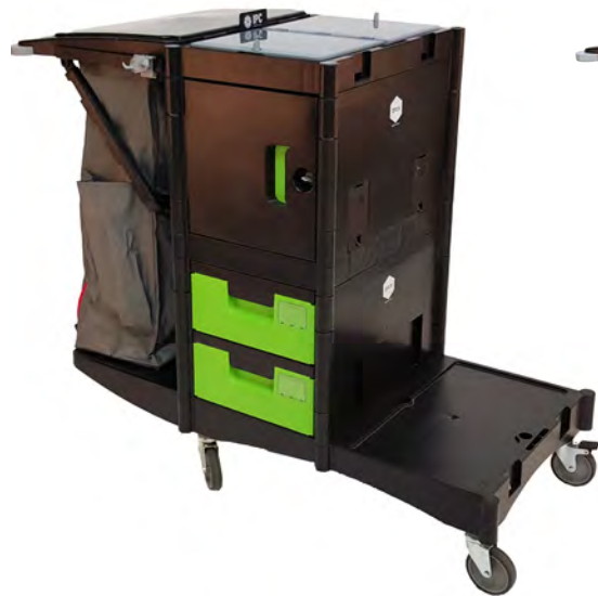
BRIX CART WITH TWO DRAWERS AND TWO DOORS