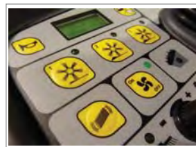
EASY TO USE CONTROLS