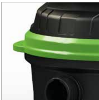
Side protection against doors and walls