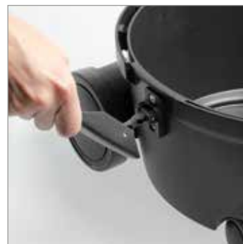
Extremely flexible hooks