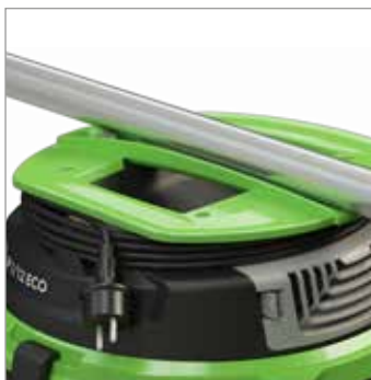
Ergonomic handle with integrated cable wrap