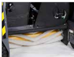
MAIN BRUSH WITH V-SHAPED BRISTLES