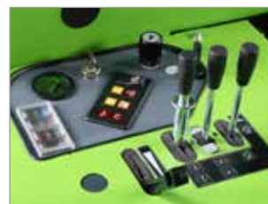
STURDY AND INTUITIVE CONTROLS