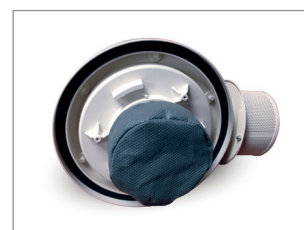
FIVE FILTRATION LEVELS WITH HEPA H14 AND ULPA U15 FILTERS