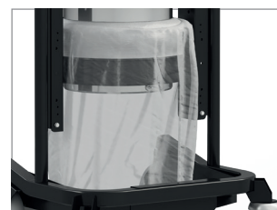
MAXIBAG COLLECTION SYSTEM