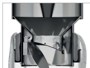
SELF DISCHARGE VALVE