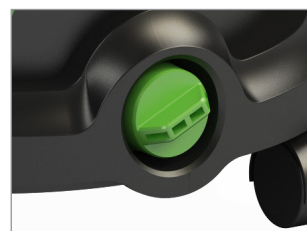
DRAIN VALVE FOR EASY AND FAST TANK EMPTYING