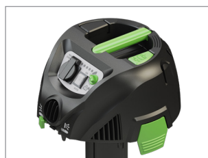
FLAT SURFACE TO PUT TOOL BOX