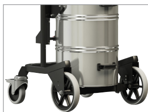
OPTIM TROLLEY IS EXTREMELY DURABLE AND MANEUVERABLE