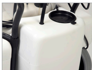
EXTERNAL DETERGENT TANK