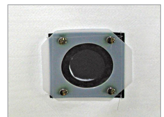
FILTER BAG WITH SAFETY VALVE FOR DISPOSAL