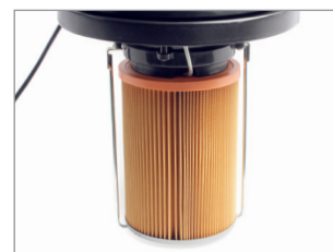
HIGH EFFICIENCY H13 HEPA CARTRIDGE