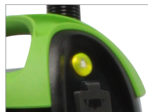
WARNING LIGHT FOR SPEED CONTROL > 20M/S