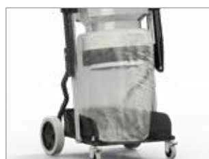
LONGOPAC® COLLECTION SYSTEM