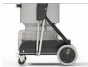
ADJUSTABLE HEIGHT TROLLEY