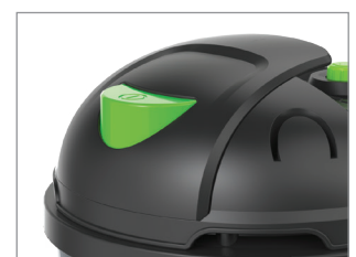
ON/OFF SWITCH OPERATED BY FOOT