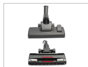
NEW POWERFUL NOZZLE FOR HIGH CLEANING EFFICACY