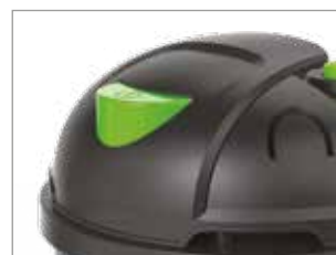
ON/OFF SWITCH OPERATED BY FOOT