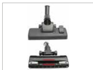
NEW POWERFUL NOZZLE FOR HIGH CLEANING EFFICACY