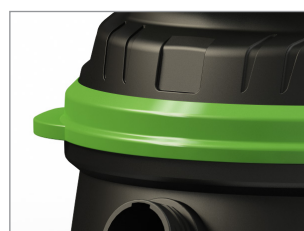
SIDE PROTECTION AGAINST DOORS AND WALLS