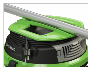
ERGONOMIC HANDLE WITH INTEGRATED CABLE WRAP