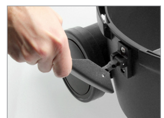
EXTREMELY FLEXIBLE HOOKS