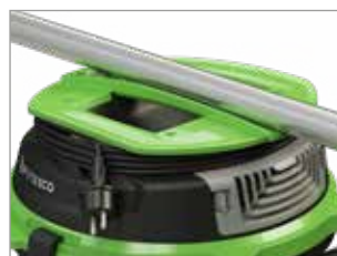
ERGONOMIC HANDLE WITH INTEGRATED CABLE WRAP