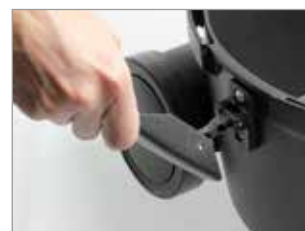
EXTREMELY FLEXIBLE HOOKS