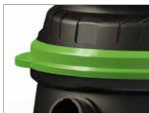
SIDE PROTECTION AGAINST DOORS AND WALLS