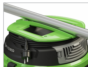
ERGONOMIC HANDLE WITH INTEGRATED CABLE WRAP