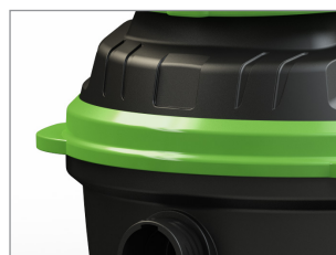
SIDE PROTECTION AGAINST DOORS AND WALLS